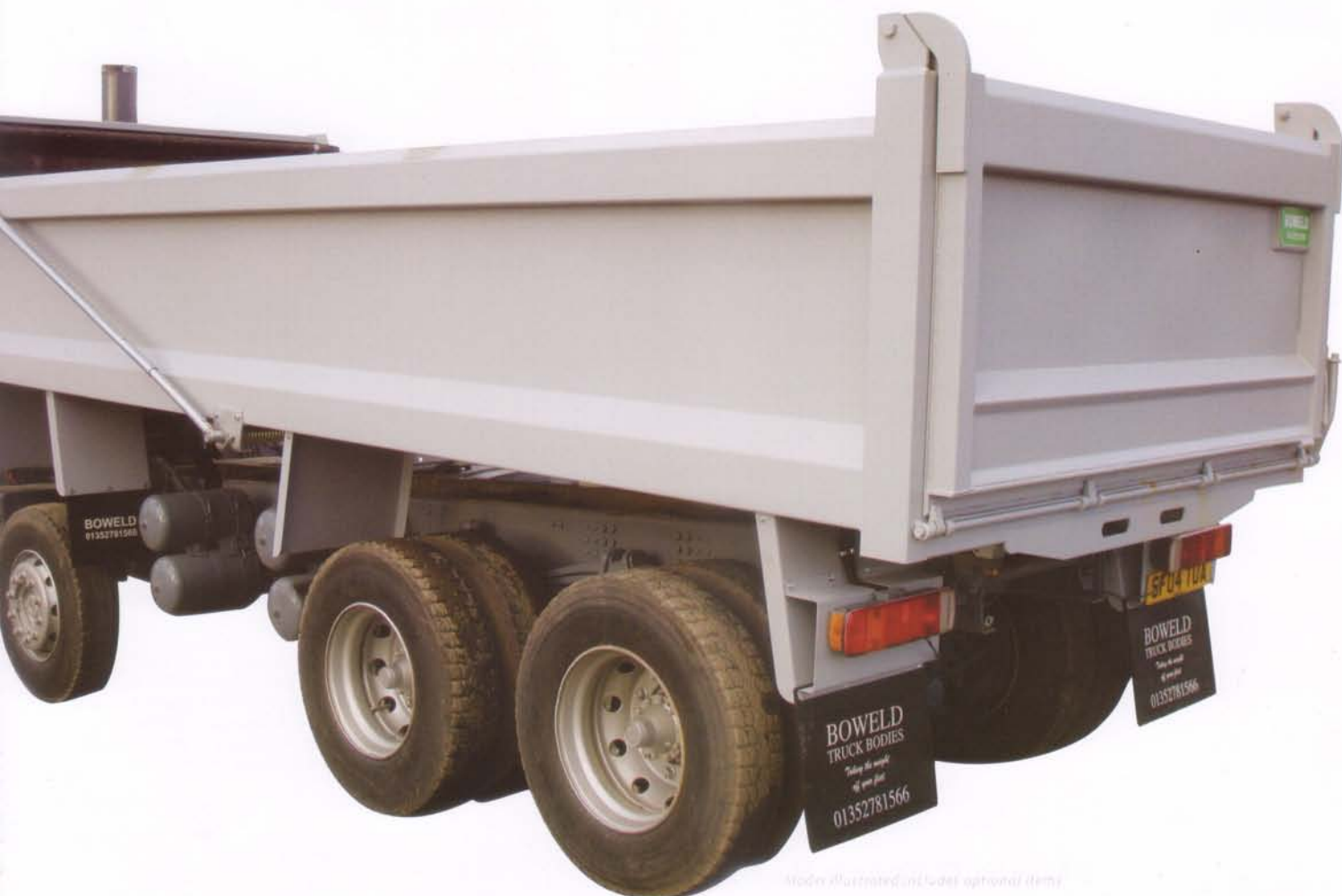
Model illustrated includes optional items

Payload and strength ...at an affordable price